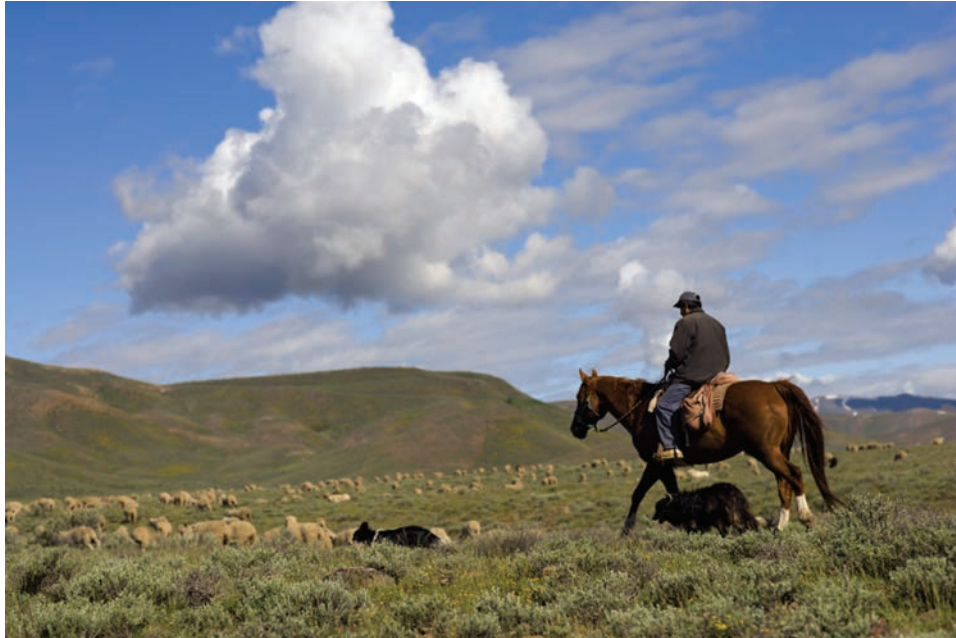
Fig. 1. —Lava Lake herder and herding dogs among the sheep.

unprotected areas, though the sheep are counted during shipping and at the end of the grazing season, which makes this scenario unlikely.