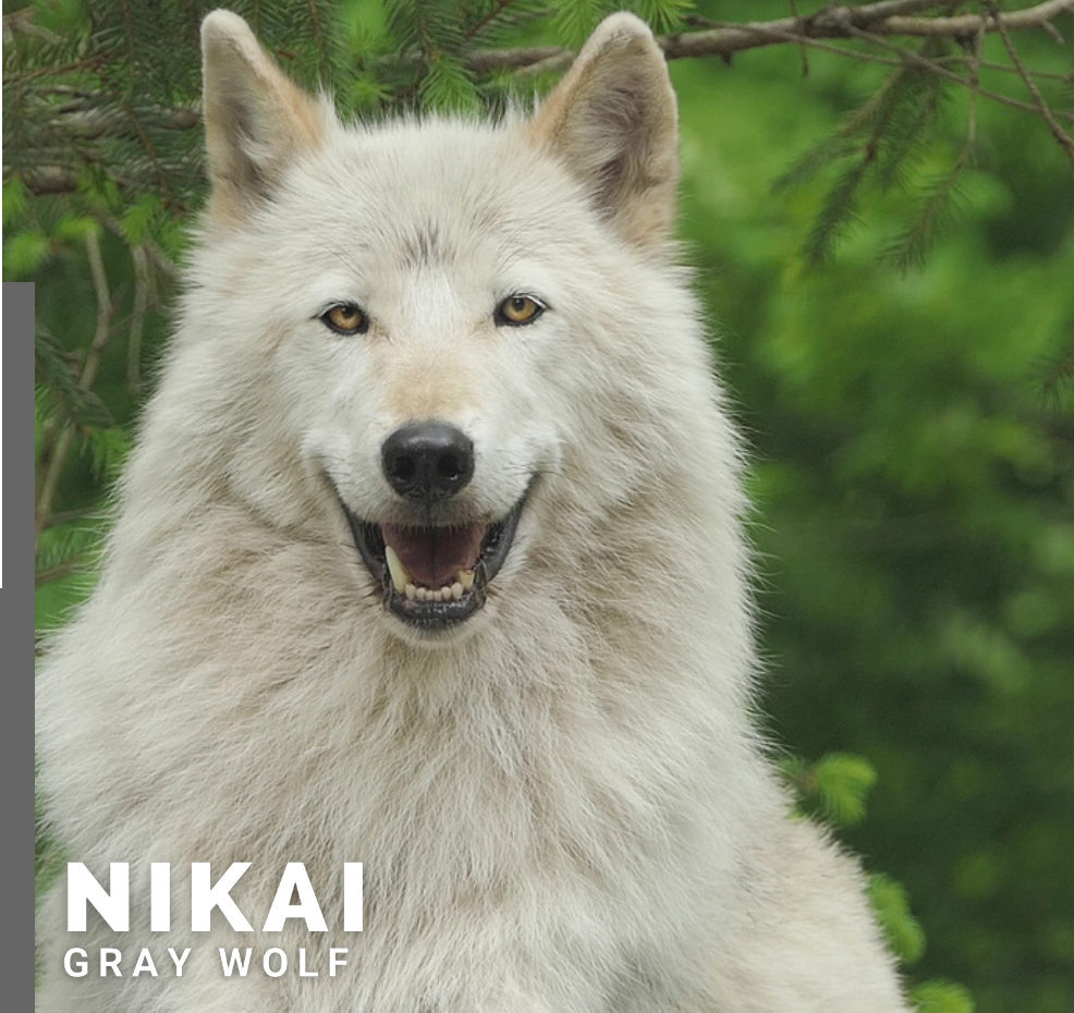
NIKAI GRAY WOLF